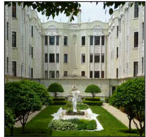
The Casa Bonita was one of the many north side venues featured this year.

The Society, working with the Chicago Architecture Foundation, selected the participating sites, recruited volunteers and provided logistical support for implementing openhouseChicago in Rogers Park and West Ridge. More than 4,000 people visited the 21 locations throughout our far north side neighborhood. Ours was one of the five participating communities in the city.