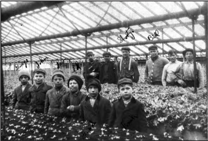
Welter Greenhouse at California and Fargo Avenues in 1905. (RPWRHS Photo E002-4315)