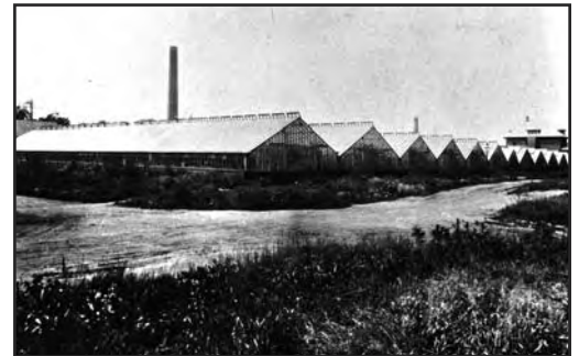
Above right, the Nepper Family Greenhouse at 4633 Murphy Avenue and at left, the Nepper Greenhouse in 1907.