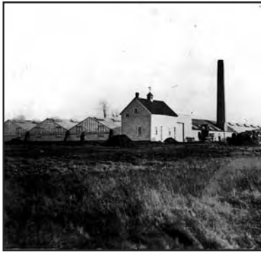
Rear view of the Thillens greenhouse at 2136 West Peterson Avenue, with the heating plant chimney at right.

I've always been interested in greenhouses as my home is built on the site of one. Maybe yours is too. H.M.