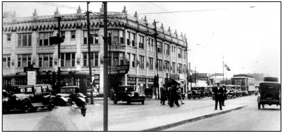
People wait in a streetcar safety zone for the southbound Chicago Surface Line’s 49 Western Route at Devon Avenue in 1929.

A streetcar safety zone is described as “the area or space officially set apart within a roadway for the exclusive use of pedestrians and protected or so marked by adequate signs or