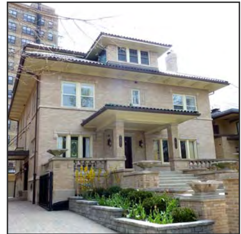
The Cat's Cradle bed and breakfast on Sheridan is one of the many north side venues featured this year.

The openhouse concept was originally developed in London nearly 20 years ago and has become an international phenomenon with programs in many cities worldwide; branded as either "Open House" or "Doors Open". No matter the name, the concept is the same; large scale, free, public events aimed at providing access to outstanding places & spaces (many not usually open to the public) as well as programs and activities that help draw participants into a better appreciation of the city and the role that the architecture, design, engineering, and planning play in supporting quality-of-life and economic vibrancy.