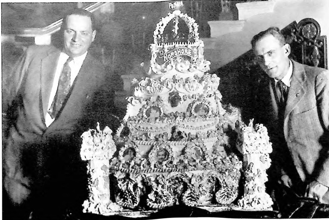
Norshore Theater Birthday – 1930 Baked by Davidson Bakeries

Looking back I cannot recall whether my friend's and my business was appreciated on the days when we procured some change and topped off our days