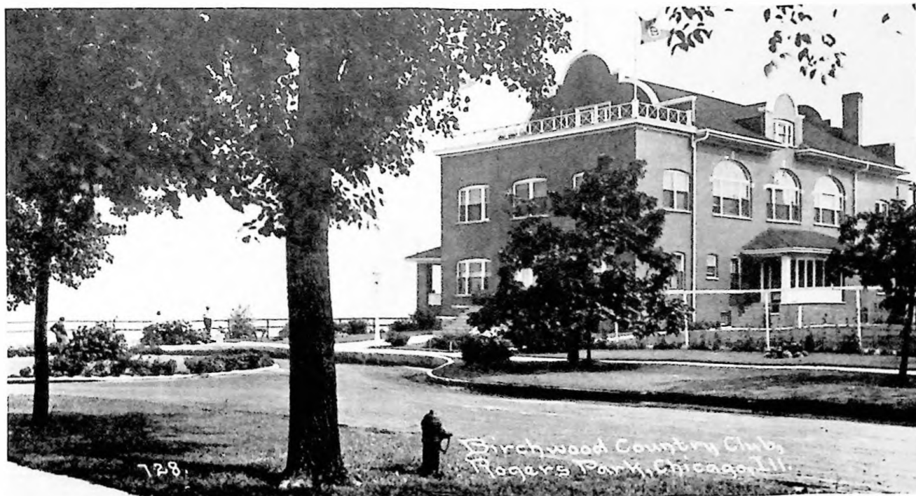
Birchwood Country Club (now North Shore School)

Photos and additional information pertaining to the Zender and Muno families dated 1880s — early 1900s