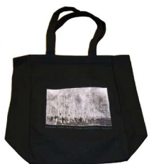
Canvas Tote Bag Nonmembers: $12 Members: $9.45