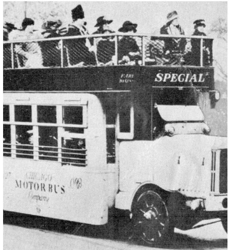
The mayor and other dignitaries take off on the first bus to run in revenue service in Chicago.