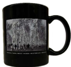
Ceramic "Birches" Mug Nonmembers: $4 Members: $3.25

You may order by phone, mail, in our store, or from our website. Please note, for orders in Illinois, we must charge 9.75% sales tax. For orders to be shipped, please include $6 shipping and handling per delivery address.