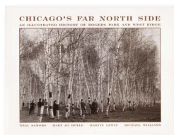
Chicago's Far North Side Nonmembers: $25 Members: $20