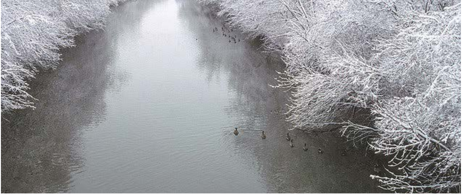
The North Shore Channel without a bridge at Pratt Avenue.

Traffic on Devon Avenue and Touhy Avenue crossing the North Shore Channel is, at best, horrendous. It's obvious that a street bridge at Pratt (Boulevard in Chicago, Avenue in Lincolnwood) would help alleviate some of this congestion. So, why is there no bridge?